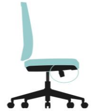
Tilting Tension Adjustment