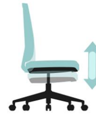
seat height adjustment