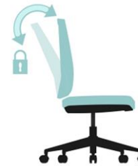
Backrest can be tilted and locked at 1 position