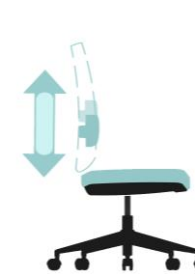
lumbar support height adjustment