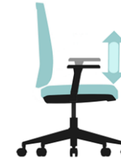
Armrest height adjustment