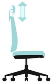
Neck-rest height adjustment